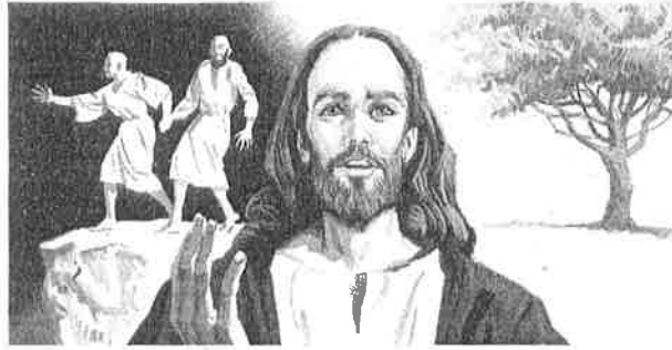
"Each tree is known by its own fruit."