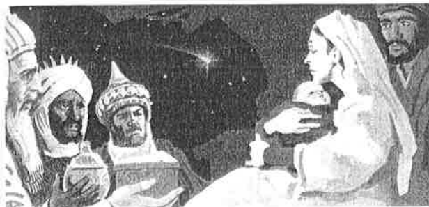
"They knelt down and paid him homage."