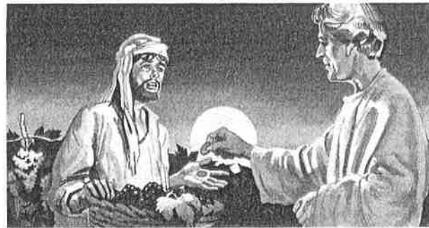
"The last will be first, and the first will be last."